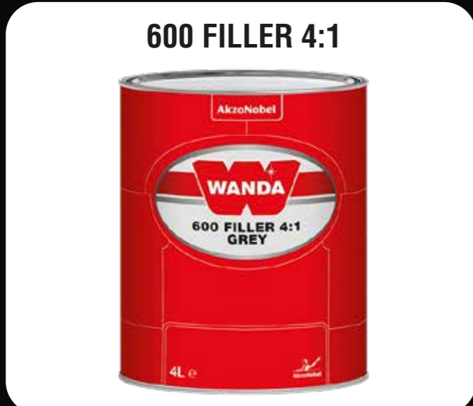
600 FILLER 4:1

Nozzle 1.6 Air Cap GTO EVO Maximum Pressure 1.8 - 2.0 Bar