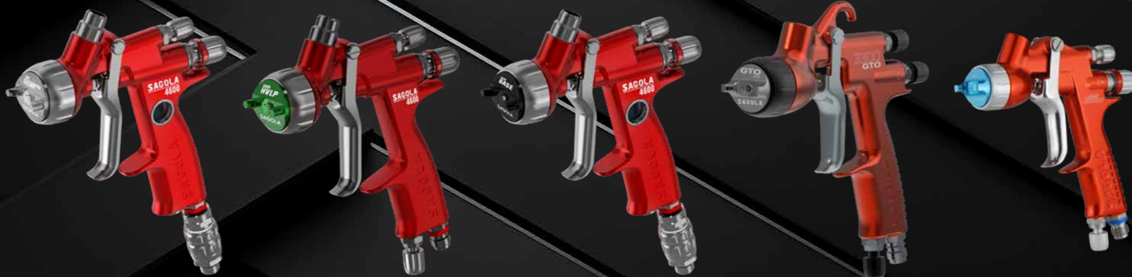
DVR CLEAR PRO SAGOLA 4600