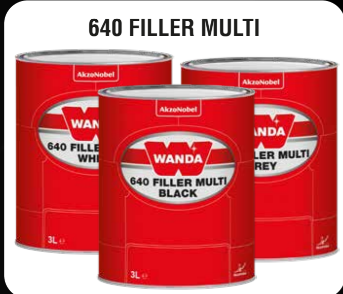
640 FILLER MULTI

Nozzle 1.2 - 1.2XL Air Cap DVR CLEAR PRO Maximum Pressure 1.8 - 2.0 Bar