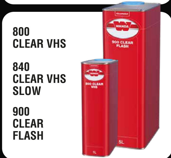
800 CLEAR VHS