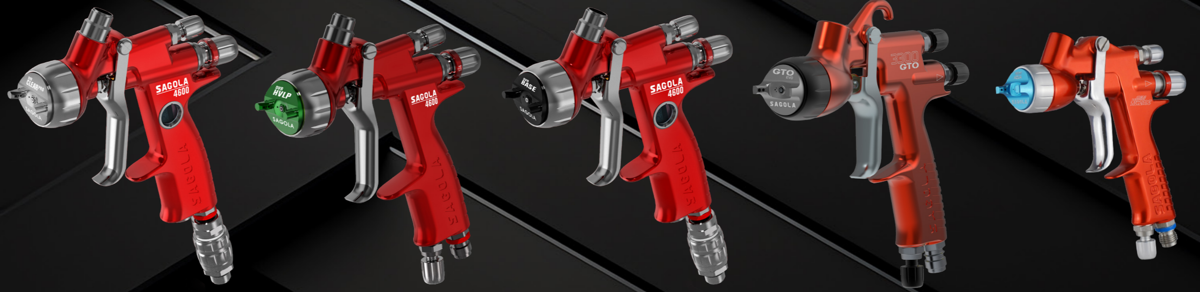
DVR CLEAR PRO SAGOLA 4600