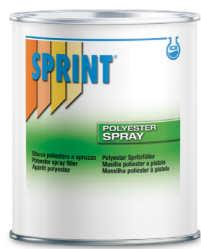
F18 Polyester Spray Filler