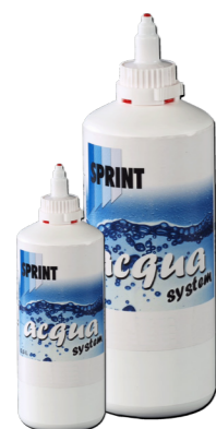
Waterborne Paint System