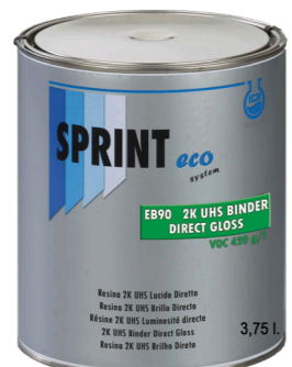
2K UHS Direct Gloss VOC 420