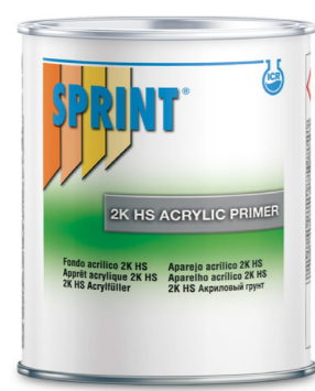
F90/91 • F57/58 • U1/U3 2K HS Primer 5:1