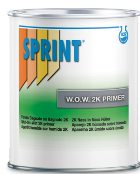
F12 Wet on Wet 2K Primer