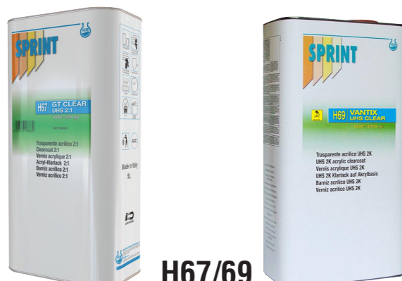
H67/69 UHS Clear 2k 2:1